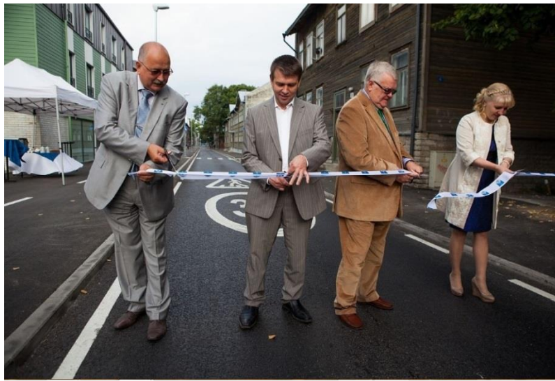
Around 500 residents opening the new pedestrian lane of Soo street in September 2013