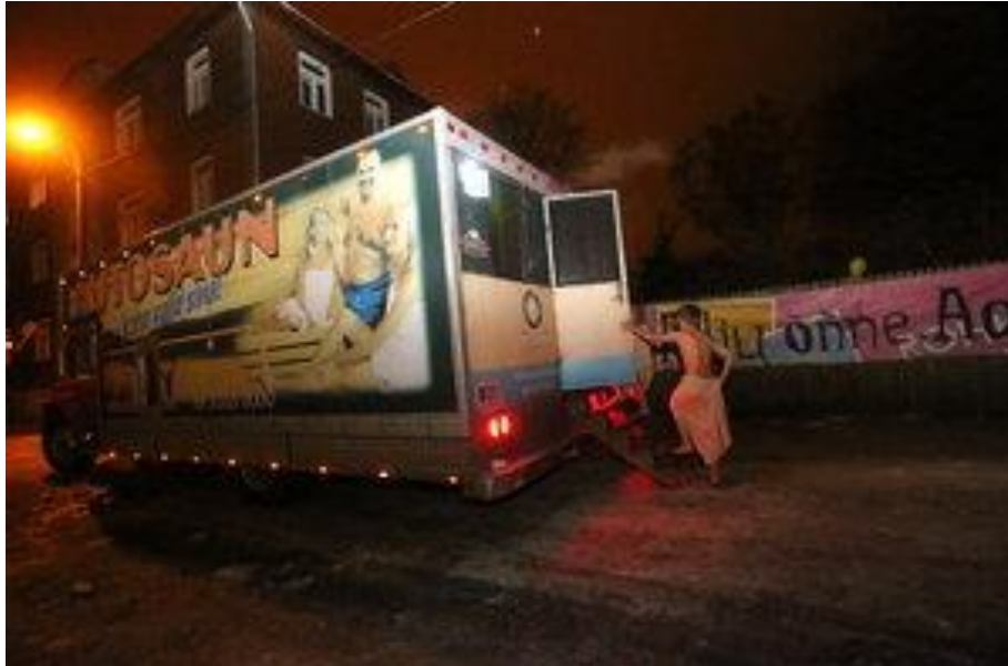
Celebrating Ao street's jubilee with street party and sauna van in February 2013