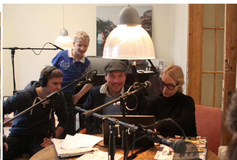
Self-initiatied library and community radio in Uus Maailm district