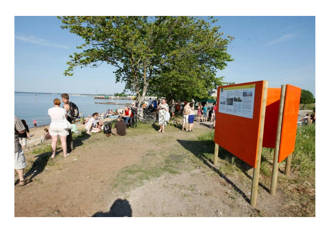
Kalarand beach installations in central Tallinn wasteland where major developments are planned

3. Active neighbourhoods show alternative ways of using space, give places new meanings and function. The more lively the neighbourhoods are, the more attractive they are for newcomers, tourists, developers, etc.