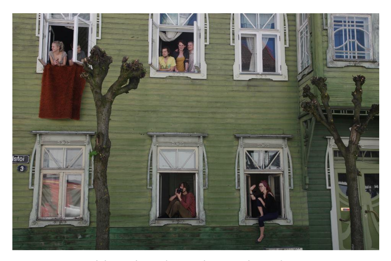
Neighbourhood watch in milieu districts

4. Active neighbourhoods are the local experts! Living locally creates better opportunities for cherishing relationships and sustaining enjoyable living environments.