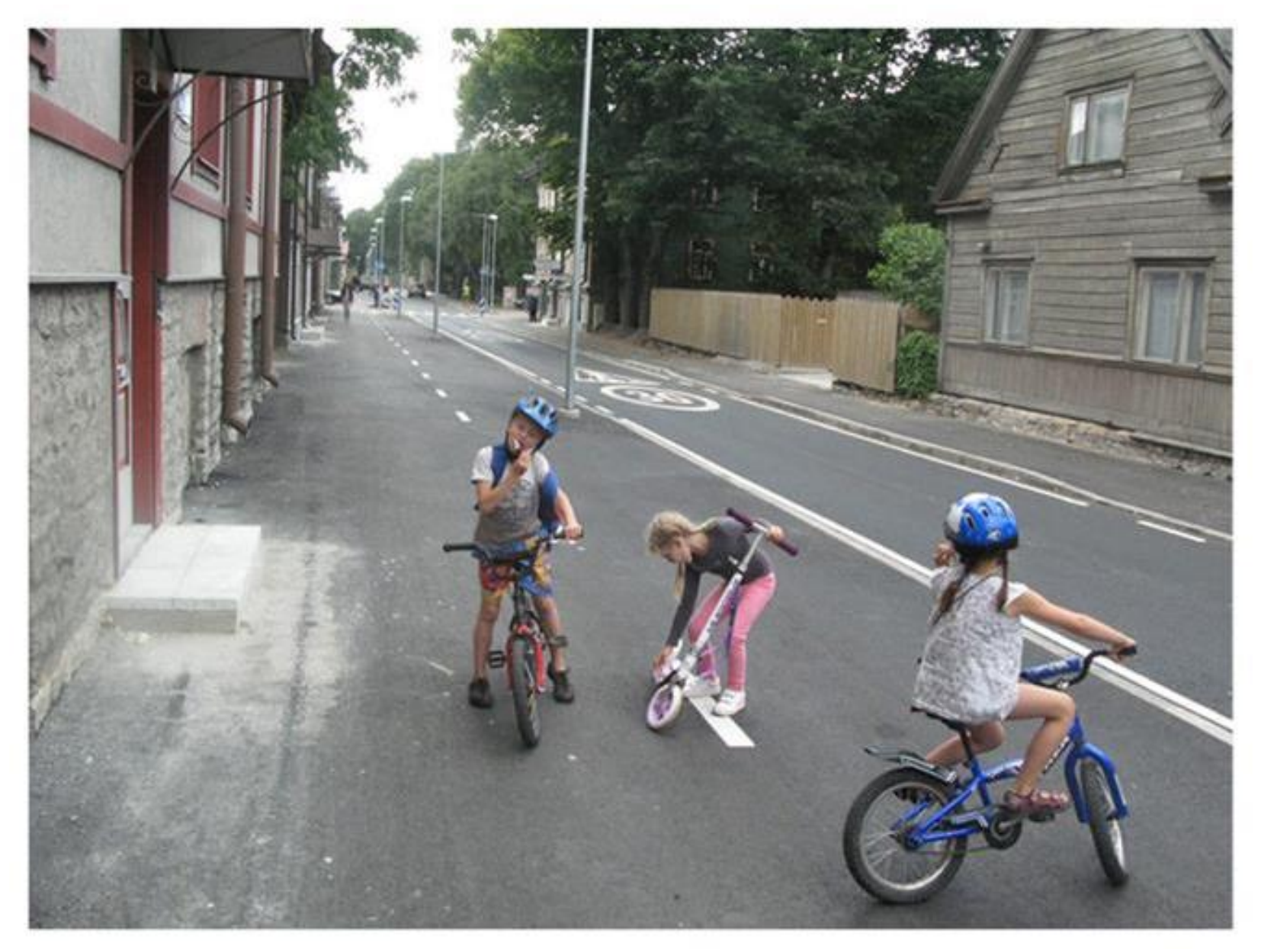
Soo street after: pedestrian friendly public space thanks to community involvement