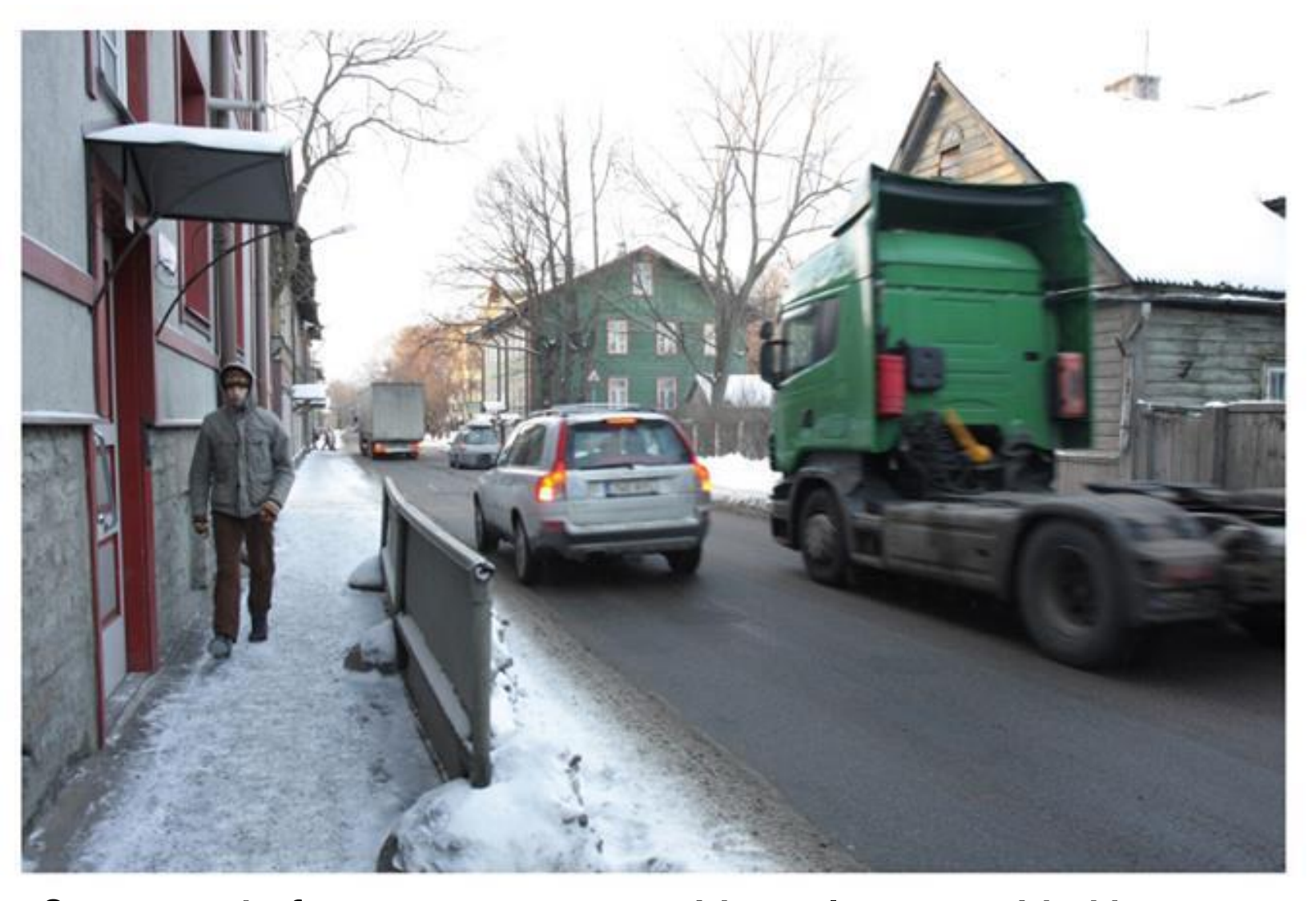
Soo street before: one-way street with two lanes, avoided by pedestrians